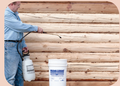
Apply Wood Preservative