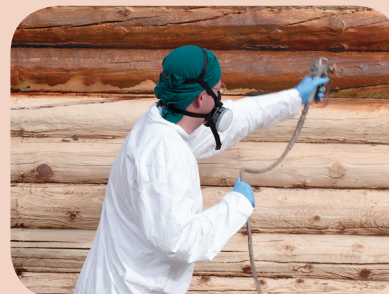
Spray on stain using a *Graco® 515 or 313 tip or equivalent.

Allow time for the PeneTreat® solution to dry, (usually 2-4 days depending on the weather and humidity—check with a moisture meter!) and then spray on—to the point of refusal—one heavy coat of Capture® Log Stain. Coat log ends multiple times to ensure the pores are sealed.