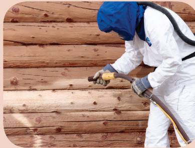
Corn Cob or Glass Blasting

Prep the log surfaces using the method that will give you the finished appearance that you desire.