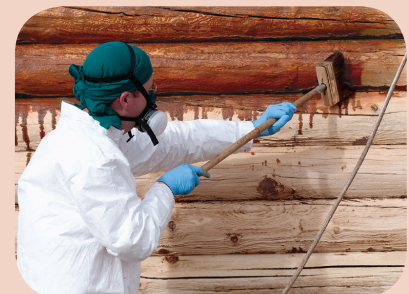
Immediately, vigorously back brush.