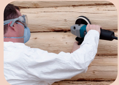
Sashco's Buffy Pad™ System or 3M® Non-woven Pad