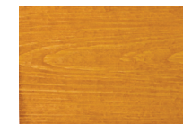
Red Tone Medium