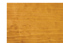
Brown Tone Medium