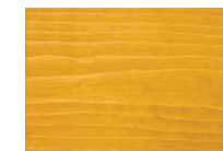
Gold Tone Medium